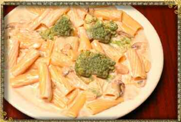
RIGATONI CON BROCCOLI

Lasagna (Siciliano)- Lasagna noodles layered with meat sauce, Ricotta, Provel, Parmesan and Mozzarella cheeses then baked. $11.95