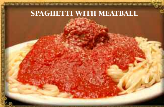
SPAGHETTI WITH MEATBALL

Manicotti- Tubular noodles filled with Ricotta cheese, in tomato sauce, topped with a blend of cheeses and baked. $7.25