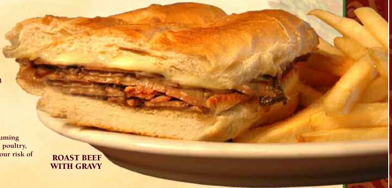
ROAST BEEF WITH GRAVY

ALL SANDWICHES ORDERED AFTER 4:00 P.M. $1.50 EXTRA ADD CHEESE TO ANY SANDWICH FOR .95