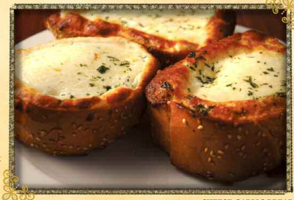
CHEESE GARLIC BREAD